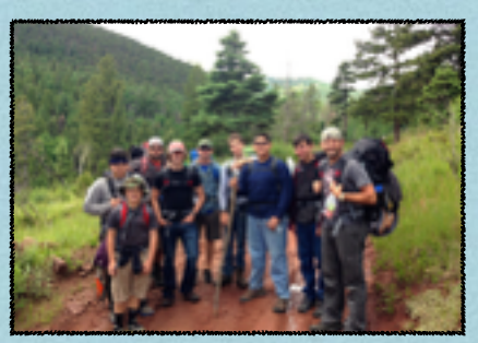
:MUSIC PASS 3-DAY HIKE:

The campers enjoyed hitting the bullseye at our 3-D archery range.